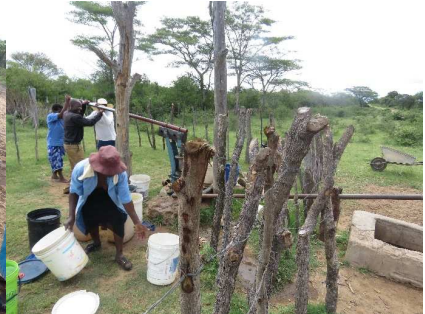
Water Surveys in the St. Mark's Catchment Area

The Rural water supply surveys are ongoing. Areas covered to date are parts of Chiundura, Lower Gweru and Silobela. On some of the sites visited you actually the boreholes require a minimum of three people to be able to pump the water out.