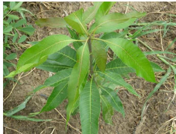
Some of Fruit Trees in Garden