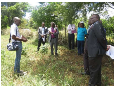
Presentation on Green Houses

One beneficiary was given a $200 push cart to compliment household income. This was part of the fighting Stigma through economic security.