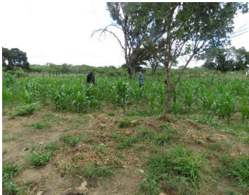
The Maize Crop

The St. Mark's Lozane Demonstration Site in pictures below..